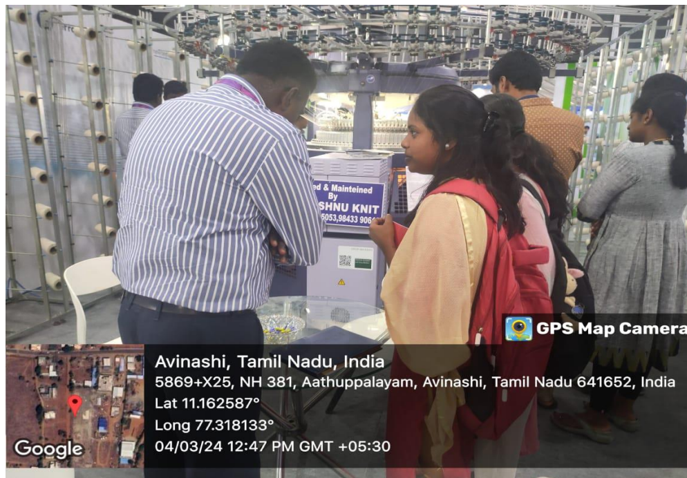
Student's interaction in KNIT-TECH 2024 on 04.03.2024