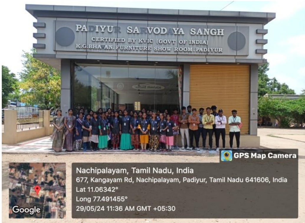
Student's visited Padiyur Sarvodaya Sangh on 29.05.2024