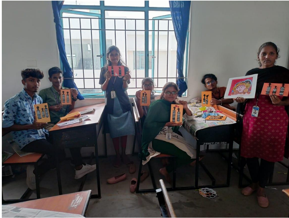
Mural painting workshop on 26.08.2023 & 28.08.2023