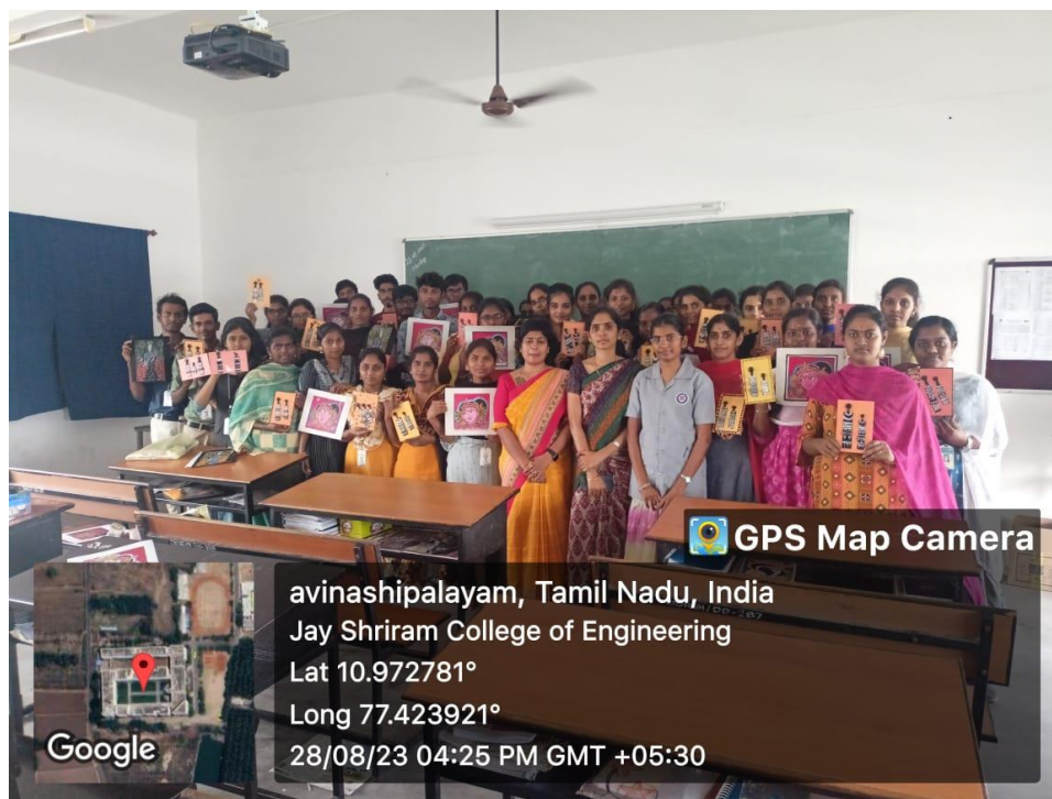
Mural painting workshop on 26.08.2023 & 28.08.2023