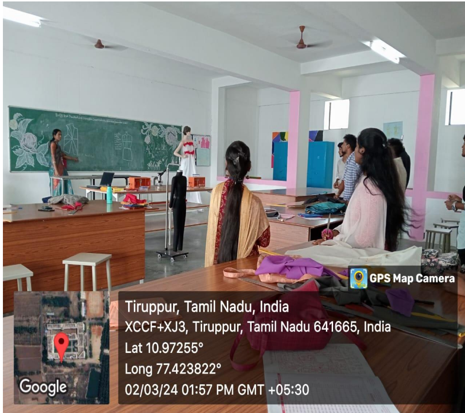
Modern draping and its application in fashion industry on 02.03.2024