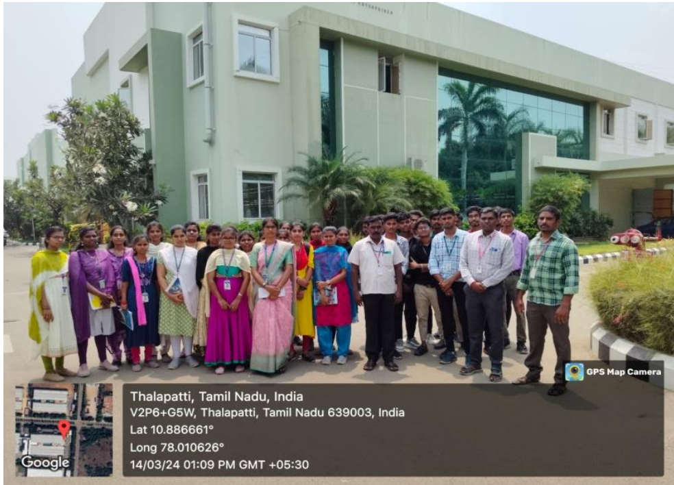
Student's in Atlas Exports on 14.03.2024