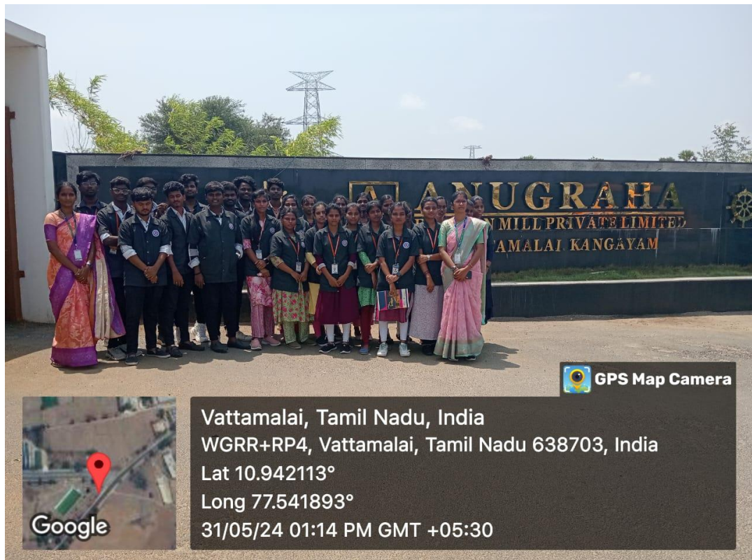
Student's visit to Anugraha Fashion Mill Private Limited on 31.05.2024