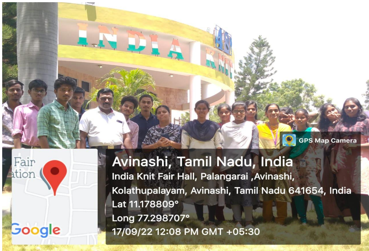
YARNEX, India Knit Fair Complex, Tirupur