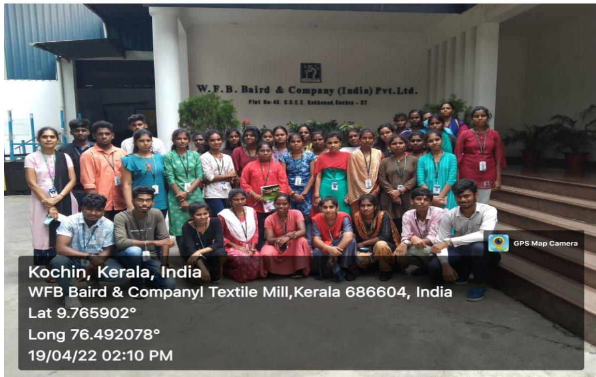
WFB Baird & Company, Kakkanad, Kerela