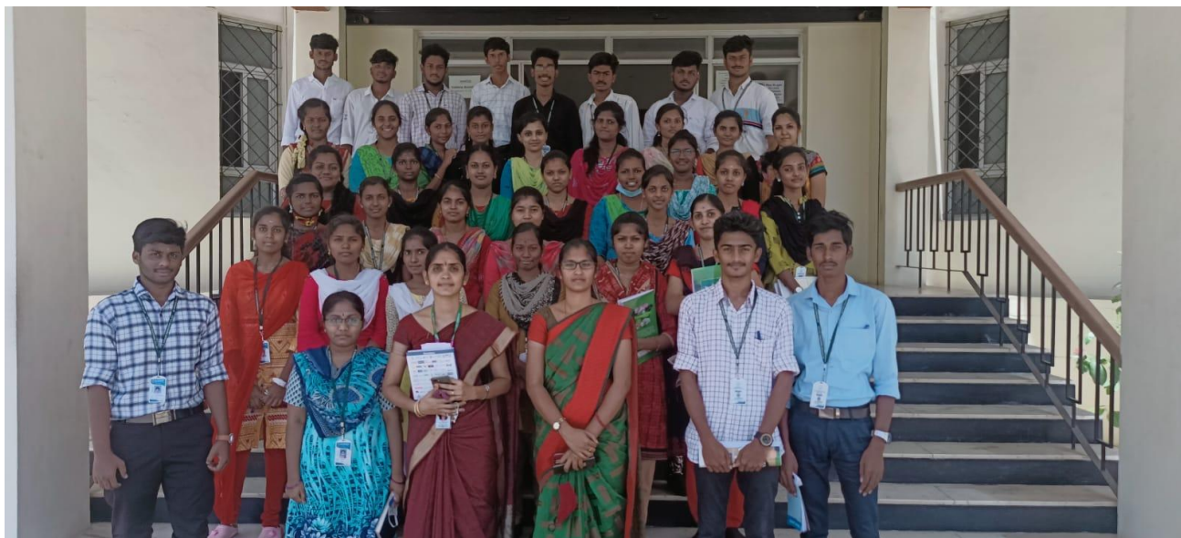
Kasthuri Sreenivasan Art Gallery and Textile Museum, Coimbatore