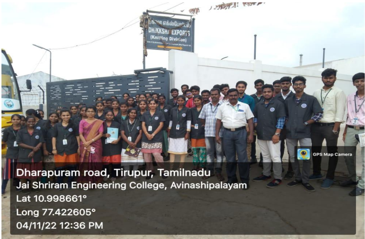
Dhikksha Exports, Tirupur