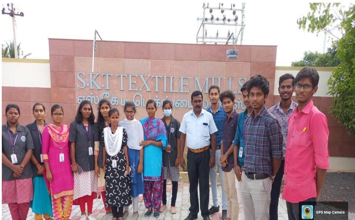
S.K.T Textile Mills, Tirupur