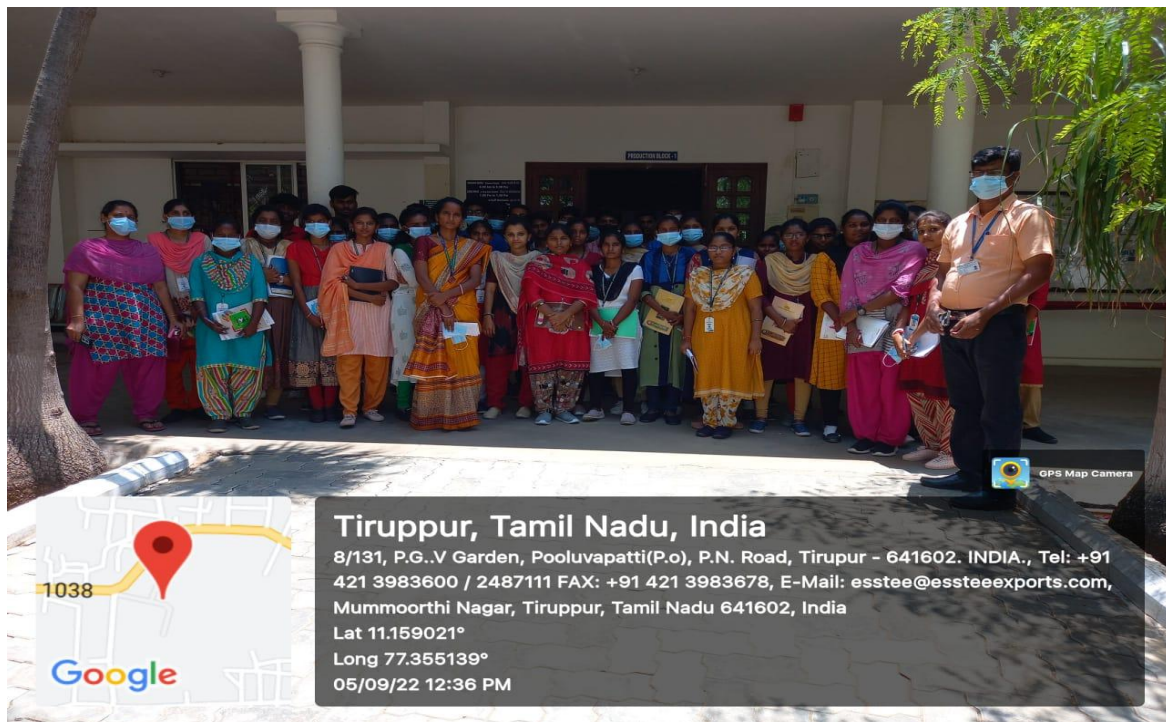
ESSTEE Exports India Private Limited, Tirupur