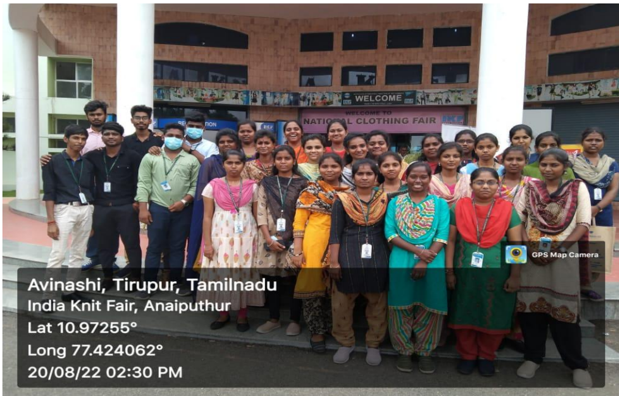
Tirupur's National Clothing Expo 2022, IKF, Tirupur