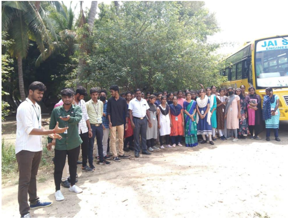
Sakthi Textiles, Tirupur