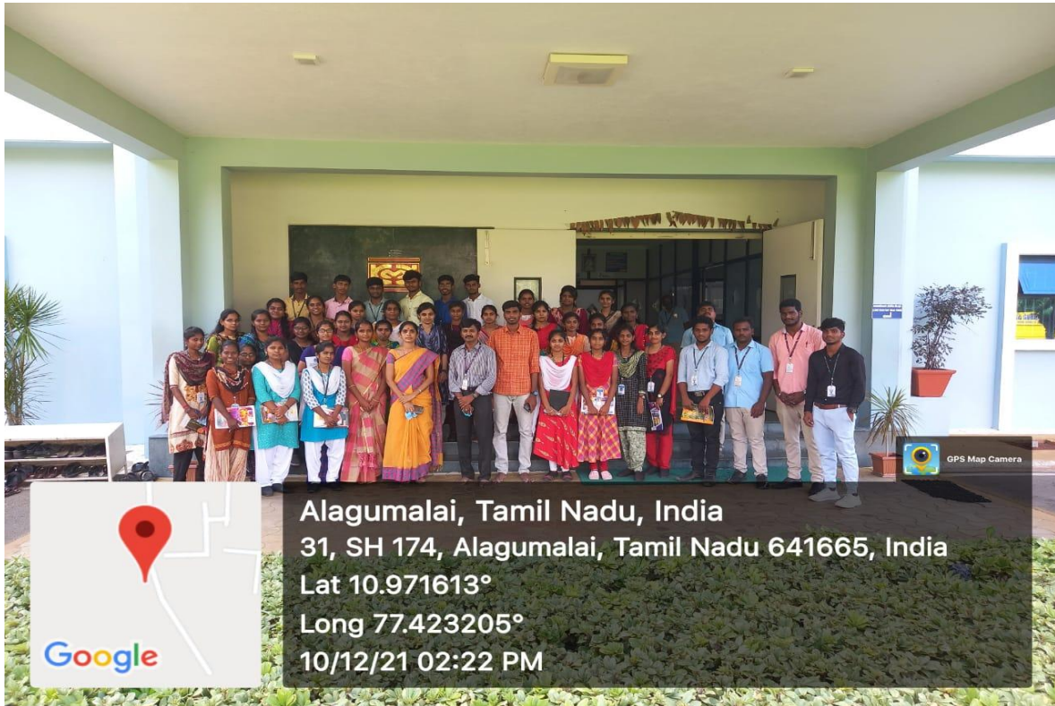
KM Knitwear, Netaji Apparel Park, New Tirupur