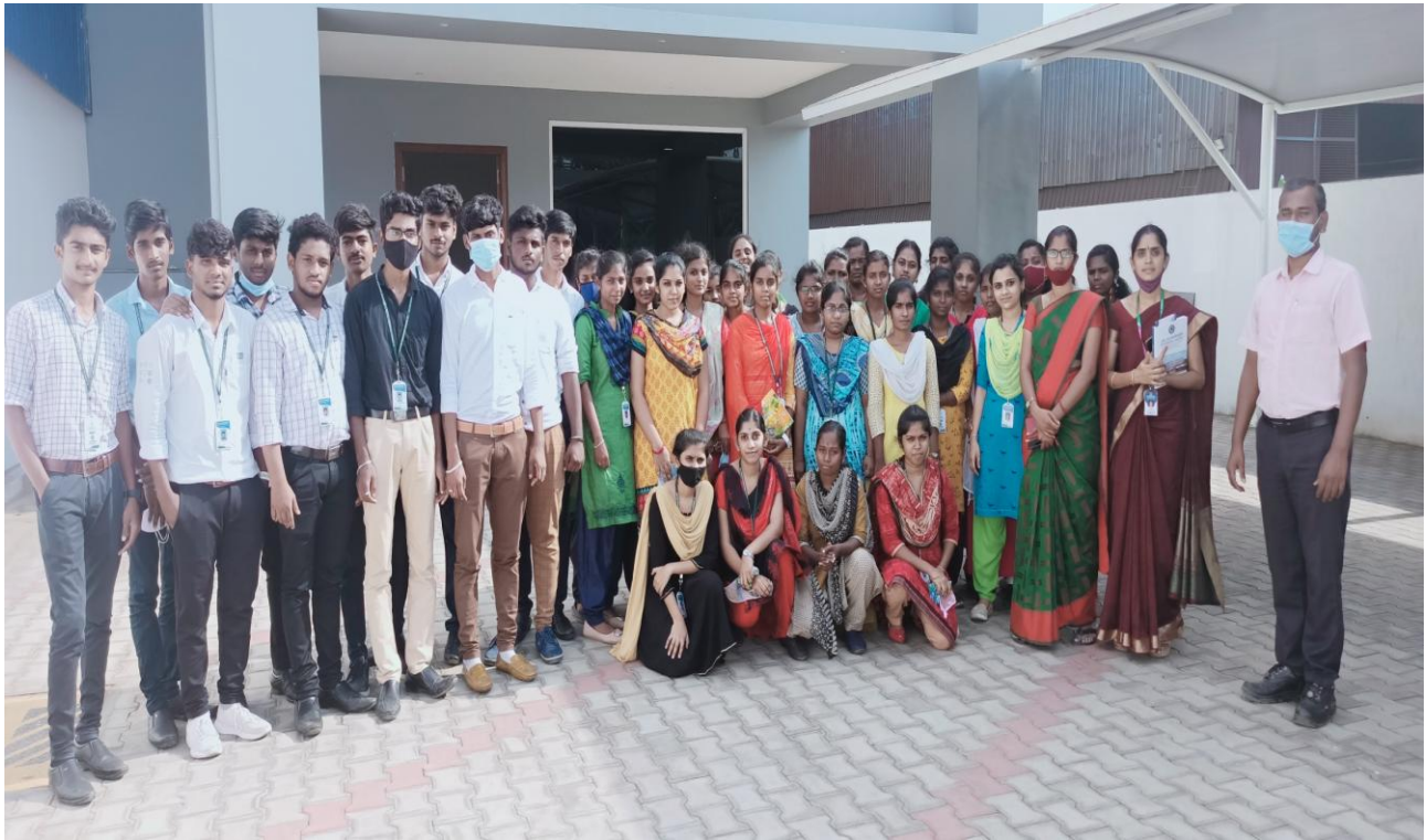
Barani Hydraulics India Pvt. Ltd.-Unit II, Coimbatore