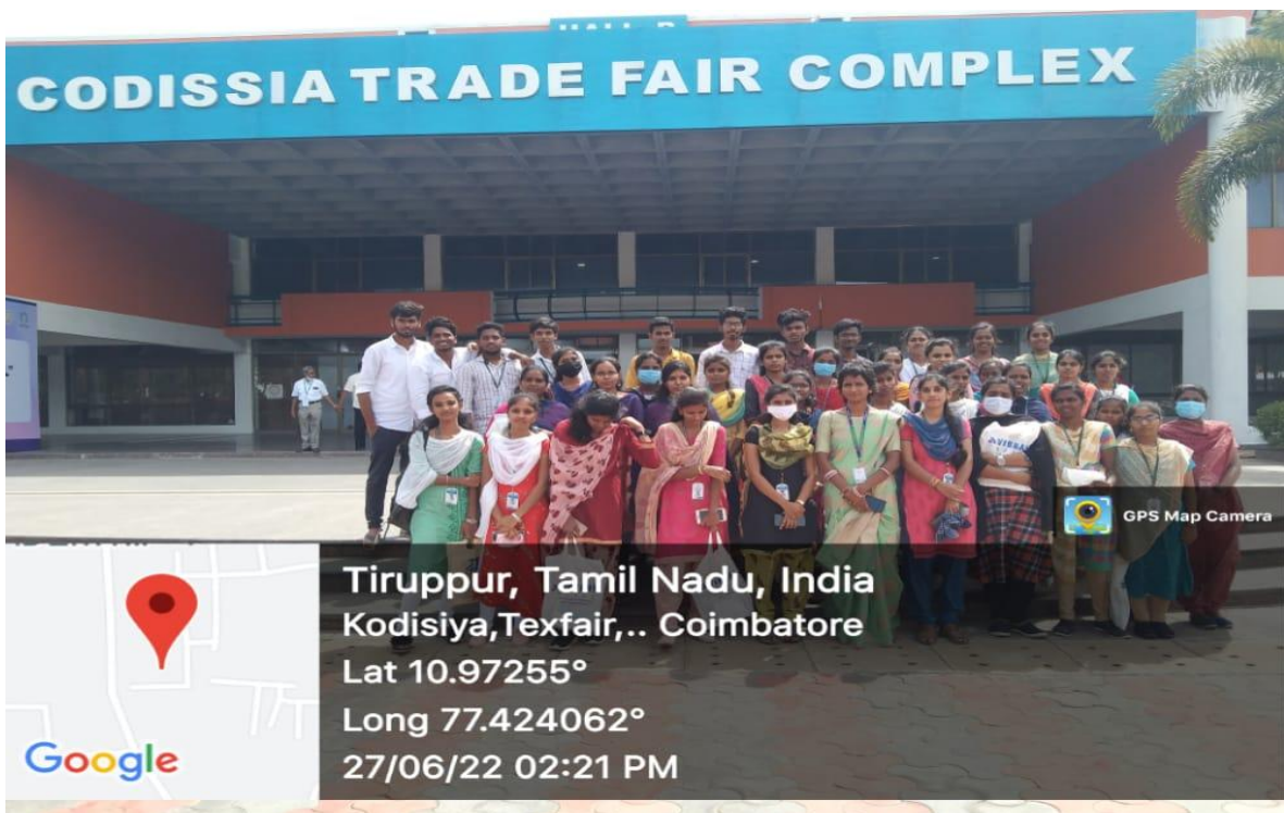
SIMA Tex Fair, Tirupur