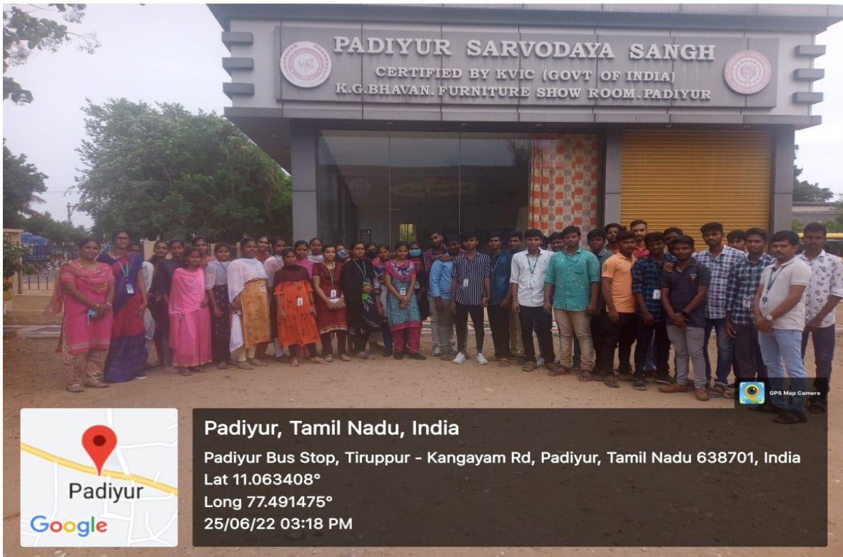
Padiyur Sarvodaya Sangam, Tirupur